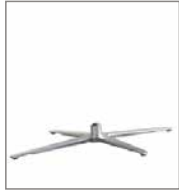
4-spoke leg, surcharge satin nickel