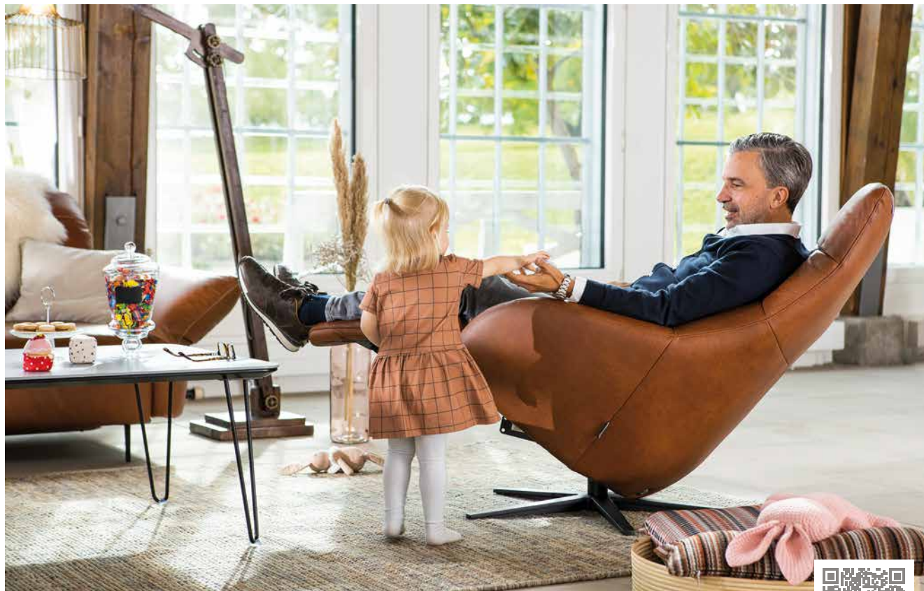
Cover: Z69/50 cognac