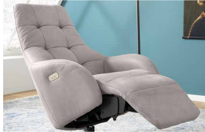
Cover: Z78/21 steel