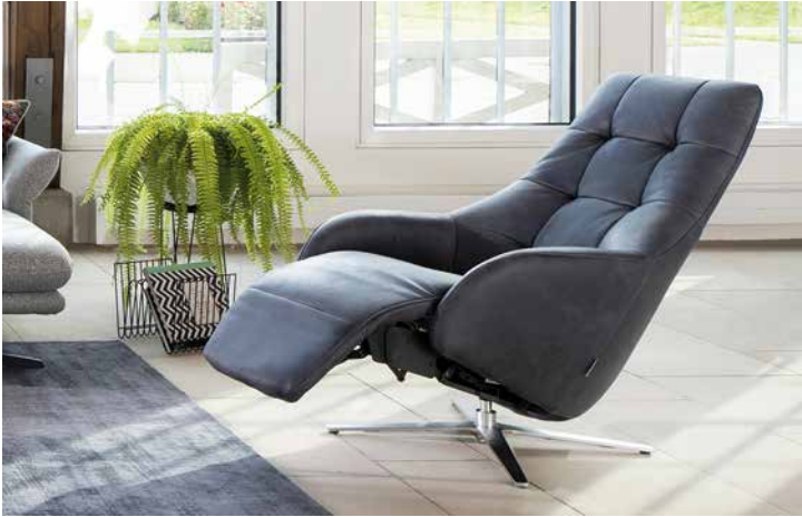
Cover: Z78/28 navy