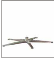
5-spoke base diff. metal col.